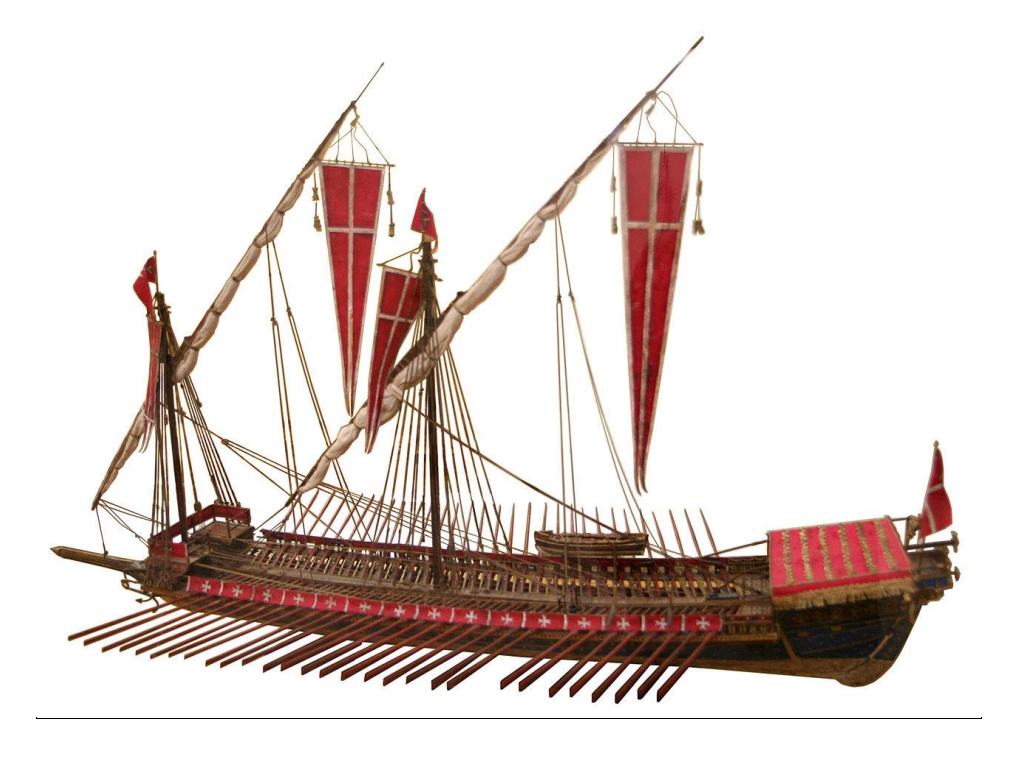
Galley of the Order of the Knights of St. John